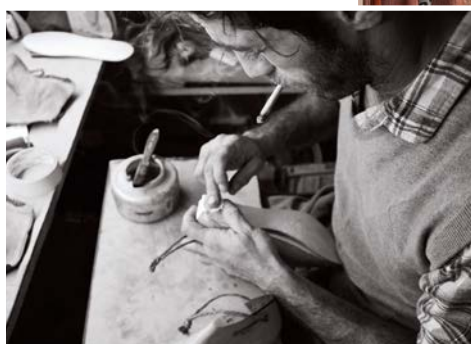
CULTURE CLUB Clockwise from left: Handcrafting footwear at La Zapateria; a cocktail at Barra 55; Bodega MATE, the museum's shop; a salad at Hotel B.