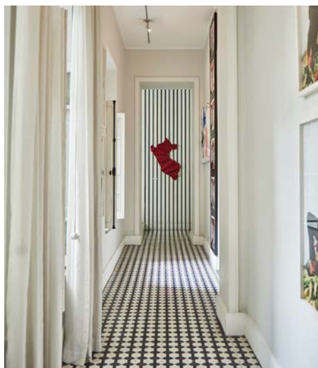
CREATIVE DIRECTIONS Above: An art-lined corridor at Hotel B. Left: Dédalo Arte's terrace cafe.