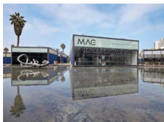
OLD MEETS NEW Above: The reflecting pool at the Museo de Arte Contemporáneo de Lima. Right: Casa Republica's restored 1920s facade.